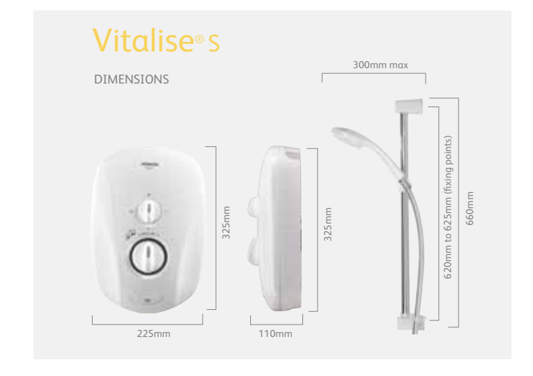
Vitalise Electric S with adjustable head - White/Chrome with White/Chrome kit