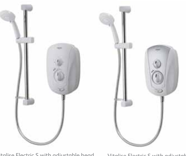
Vitalise Electric S with adjustable head - White with White/Chrome kit