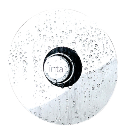
Time Flow Shower Concealed TF997CP