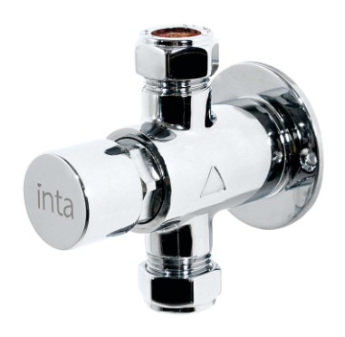
Time Flow Shower Exposed TF997CP

Water conservation is essential and in some public establishments where multiple water outlets are used, the Inta range of Time Flow Control systems are an eco-friendly, stylish and economical solution to the problem of water wastage. All of the Inta Time Flow Controls are designed to work with the Intamix range of the Thermostatic Mixing Valves